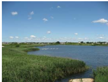
Views of Cockeast Pond