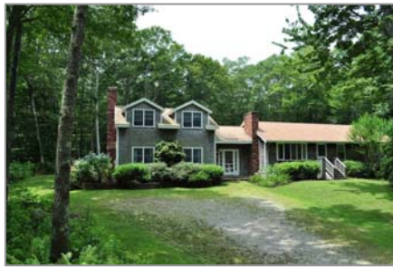
Approach to Residence