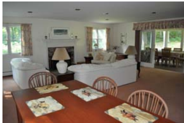
Fireplaced Great Room

Mature plantings Outdoor shower Two decks, screened in porch Large, sunny backyard Close to Westport Harbor beaches, the Atlantic Ocean, Westport River, and all summer-related activities