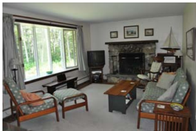
Fireplaced Living Room

Mature plantings Outdoor shower Two decks, screened in porch Large, sunny backyard Close to Westport Harbor beaches, the Atlantic Ocean, Westport River, and all summer-related activities